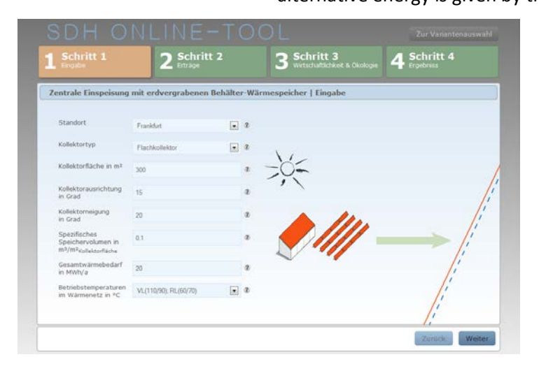
Screenshot of the user interface for central SDH plant

In addition to the inputs for the decentralized integration, the following inputs are needed : Storage performances Solar fraction Primary energy and CO2 savings if data about alternative energy is given by the user