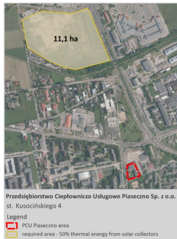
Map 2. Area required to achieve 50% of thermal energy production from solar collectors.